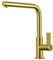
Mixer Tap Omega Gold